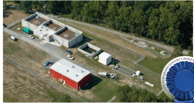
Award-winning nutrient reduction and water reuse at the Penn National Wastewater Treatment Plant, Pa.