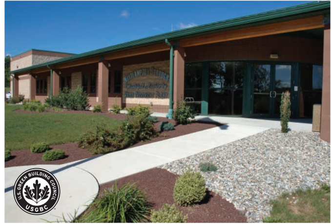
The first LEED®-certified water treatment plant in the U.S. for the Northampton Borough Municipal Authority, Pa.